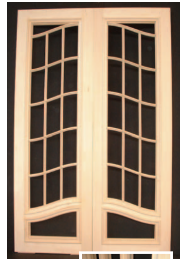
Woodbending by Woodform